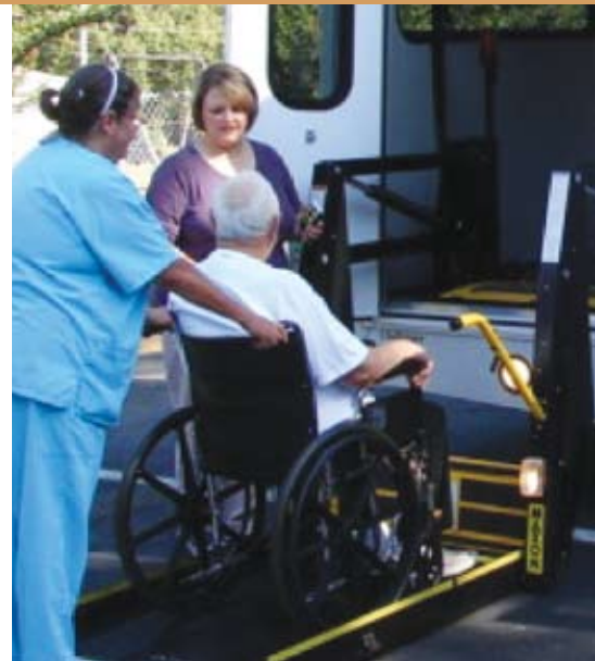
HMC Health and Rehabilitation Center's staff assist a resident into its new van for an excursion in the community.